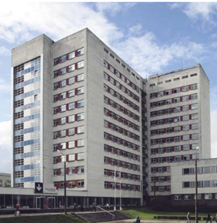
North Estonia Medical Centre

We give planned and emergency treatment in the Department of Dialysis and Nephrology of the Medical Centre. The department has 17 beds for investigation and treatment of people suffering from renal diseases. We also carry out renal replacement therapy – haemodialysis, peritoneal dialysis and the treatment of patients with renal graft. We do about 6000 dialyses annually.